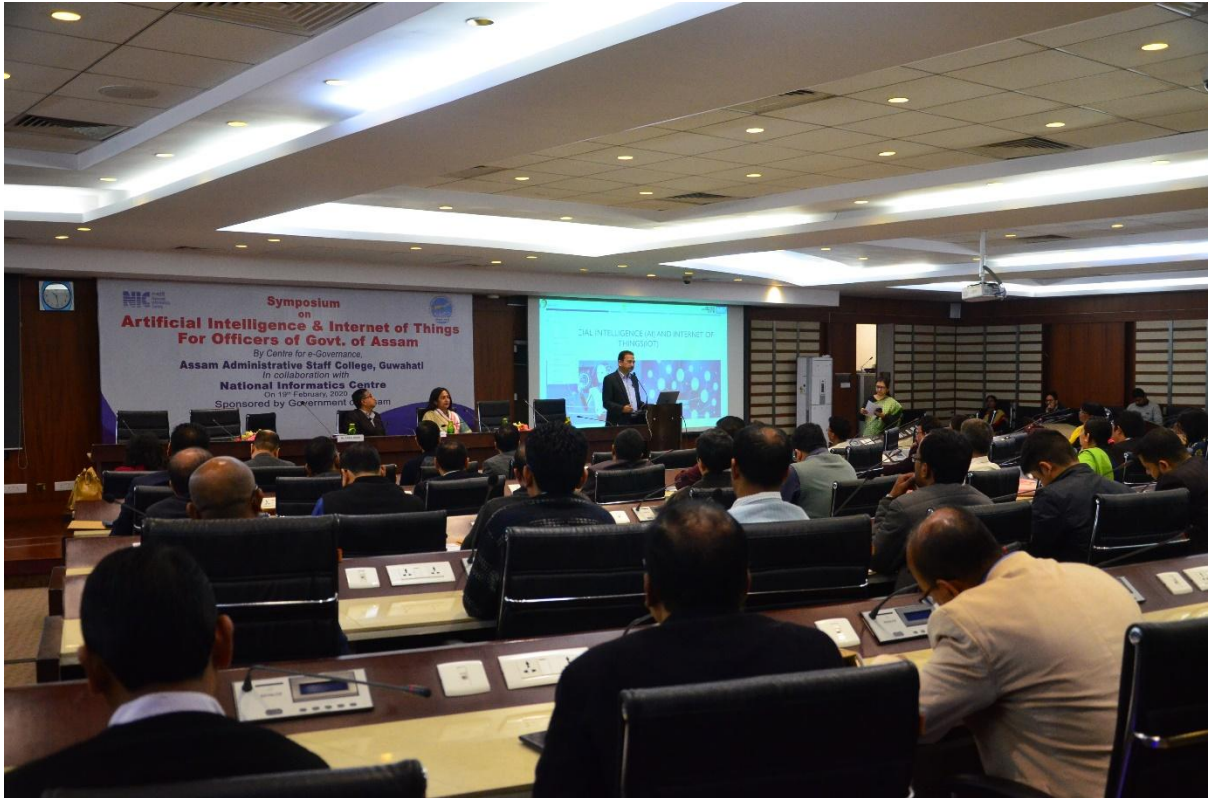
Some glimpses of the symposium